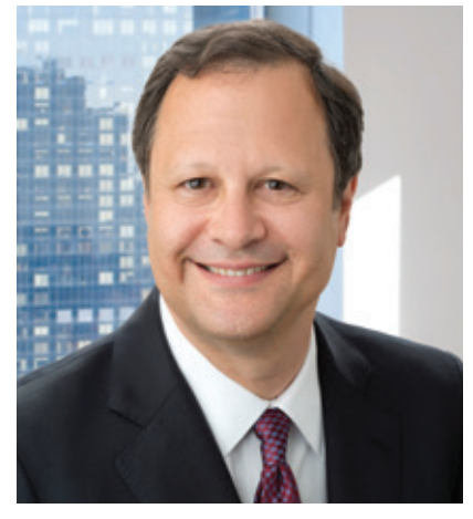
Granoff: dealflow is robust but pricing remains tight

I haven't seen too many good funds that needed to be restructured, so the barrier for our participation is high. We have been sellers in many more cases than we have been buyers. Pricing is generally high and close to NAV. There is usually not much growth »